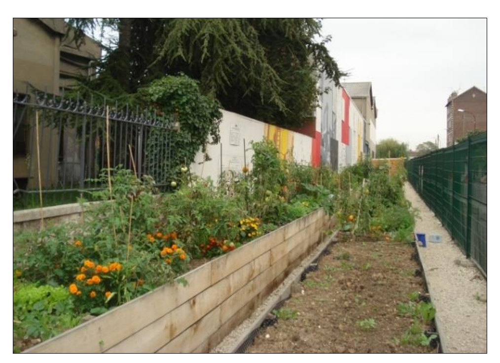
Figure 4: Cristino Garcia collective garden in Saint-Denis, north of Paris.

temporary access to their lots and, as a consequence, many have adopted temporary structures to hold soil, such as raised beds or trays (see Figure 4), without making them an explicit objective of the project (which is why we do not consider them "nomadic"). Most garden participants explained that the main reason they adopted raised beds and trays is because they are in fact a relatively cheap way of resolving the issue of possible or existing soil contamination, which can be used by city health departments as a justification to prohibit food production. In 2014, twenty-three of the forty-four institutionalized gardens studied were entirely cultivated with raised beds or trays, and nine partly so. All were used for vegetable production. This proportion has since increased; of the six gardened vacant lots that have been removed, which were among the oldest shared gardens, five were cultivated directly on the ground.