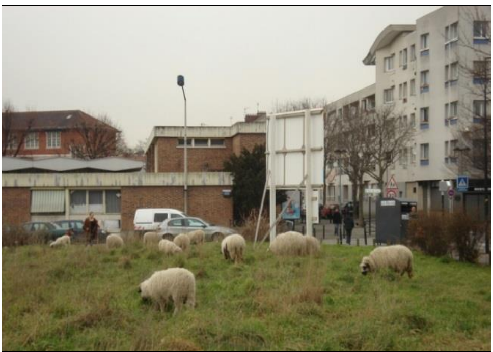
Figure 3: Pictures of sheep herding (top) and rangelands on vacant lot (bottom) in Saint-Denis, north of Paris.

These nomadic off- or on-the-ground UA initiatives comprise only a small part of the urban agriculture initiatives we observed. Nevertheless, a greater number of gardens – half of the collective gardens we visited – have only