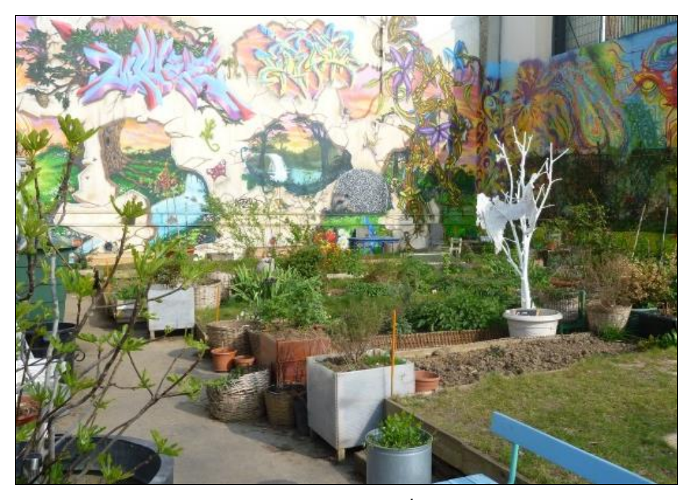
Figure 2: Ecobox, a garden on pallets in the 18<sup>th</sup> arrondissement, Paris. Photos by the authors, March 2010 and April 2012.