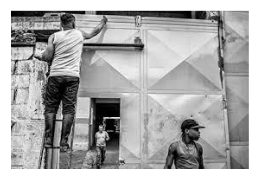
Figure 6: Resident working on construction in Torre David. Alejandro Cegarra, 2012.