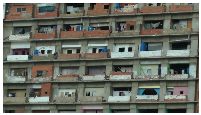
Figure 5: West façade of Torre David showing the street-side view of the tower's newly constructed residencies.

collective responsibility, the residents defined the rules and managed their coexistence. With this organization in place, residents negotiated with the state-owned electrical and water companies agreeing to service a huge debt that the tower had accumulated in the years of abandonment, all of which was eventually paid off using condominium-type fees from coop members.