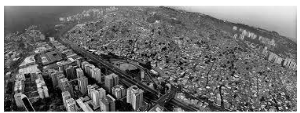
Figure 2: Caracas' drastically segregated socio-spatial composition: Formal high-rises in the forefront, self-built settlements in the background. André Cypriano, 2014.

Drug-related crime was rampant throughout the 1990s, producing a popular conception of the barrios as crime-dens and of their inhabitants as criminals ( malandros ) (Pedrazzini, 2014). In a process similar to that seen in other parts of Latin America—for example in the larger cities of Brazil, Colombia, Mexico, Honduras, and El Salvador—private and para-police forces sprouted up in both elite and poor neighborhoods, stimulating people's retreat indoors or into gated communities, shopping malls, and other consumer spaces where citizens felt safer (Irazábal, 2009; Handal and Irazábal, 2019). Not only did these security practices further segregate the city, and particularly its barrio inhabitants, but they also resulted in the privatized commercialization of urban public space (González Téllez, 2012).