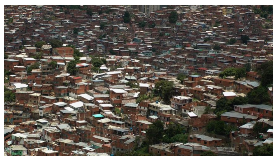
Figure 3: Ranchos (shacks) in Barrio Mariche, Caracas.