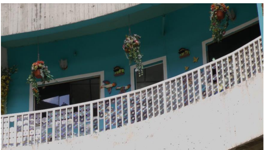
Figures 7a and 7b: The Atrium, intended as the tower's grand entrance, displayed private balconies with decorative markings that made each housing unit unique. Irene Sosa 2014.

In the realms of space creation, management, and capital investment, residents "look[ed] backward, to their experiences of the barrio, in order to move forward, toward a normalized idea drawn from middle-class standards" (Brillembourg and Klumpner, 2013, 208). Drawing from the trial-and-error tactics used in the barrios, residents adapted the tower's structural infrastructure, creating and separating residential units with brick infill. When design plans were frustrated by the existing tower design, residence broke through walls recreating the circulatory and ventilation logics found in barrios. Through these actions residents' asserted control over a portion of Torre David's territorial hierarchy (Habraken, 2002). Similarly, their complex and personalized internal decorations revealed both their cultural pride (evident in familial, religious, and political iconography) and their social aspirations. It is critical on both micro- and macro-spatial levels to see