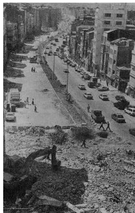
Figures 2 and 3: Before the opening of Tarlabasi Boulevard (Left); after the opening of Tarlabasi Boulevard (right) (yapi.com.tr).

Secondly, in the 1990s Tarlabasi experienced a different kind of rural to urban migration. Kurdish people affected by military activity in the east of Turkey were forced to leave their home lands and were without any means of financial support. These people started to move to Tarlabasi, because the rent was very cheap and area was very central for accessing jobs (Islam, 2010; Unsal, 2015).