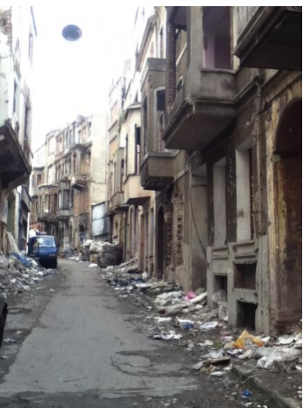
Figures 10 and 11: Photos from and around the Tarlabasi Renewal Project area, Author's personal archive, 2013.