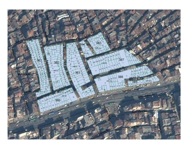
Figure 5: Tarlabasi Renewal Project (Istanbul Metropolitan Municipality, www.ibb.gov.tr, 2015).

This Project was heavily criticized by the CoA, academics and NGOs. Nevertheless, on 30 September, 2007, the Project was accepted by the Urban Renewal Commission working under the authority of the Ministry of Culture and Tourism - in other words, the national state (The Chamber of Architects 40th report, 2008-2010). The CoA filed a lawsuit against the Project and against Law 5366 on 22 April, 2008 on the grounds that the law and the project do not oversee public interest and in conflict with other urban planning and conservation laws of Turkey, but the law court decided the case in favour of Gap Insaat (Chamber of Architects, 2010).