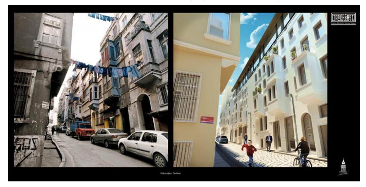
Figure 9: Comparison between current and Project Tarlabasi, SakizAgaci Street, Tarlabasi Urban Renewal Project Leaflet, Gap Insaat, 2013.

But even though there were 210 listed buildings, the expert report about the Project area clearly states that all the buildings in the area should be demolished and there is no building that is sound or worthy enough to preserve. The plans for the Project show that the proposed buildings have little in common with the current buildings. In addition, the plan proposes several storeys of car parking under every building, and nine apartment-blocks that have nothing in common with the original architectural fabric of the neighbourhood. In the end, even though the Project offers preservation of the neighbourhood, in practice there is no evidence of this. Figure 9 below show Tarlabasi as it is currently and is proposed once the Project is finished.