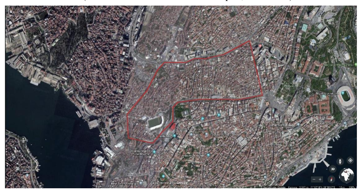
Figure 4: Tarlabasi neighbourhood (Google Earth).

Under the provisions of Law 5366 enacted on 5 July, 2005, which enables "regeneration" in historic areas, nine blocks (see Figures 4 and 5) in Tarlabasi were declared as "urban renewal" areas on 20 February, 2006. It was intended to convert the buildings into hotels, shopping spaces and residences. This initial stimulus was expected to trigger a complete physical change and gentrification of the whole area (Türkün and Şen 2009; Türkün, 2011; Kuyucu and Ünsal, 2010). On 16 March, 2007, Beyoglu Municipality put the preliminary Project for Tarlabasi renewal area up for tender, and on 17April, 2007, the construction company, Gap Insaat, won the tender. (This company's CEO is a relative of Erdogan's and has been at the centre of corruption discussions because of this connection.) The preliminary Project prepared by Gap Insaat proposed the demolition and reconstruction of all historical buildings in the renewal area (The Chamber of Architects 40th Report, 2008-2010).