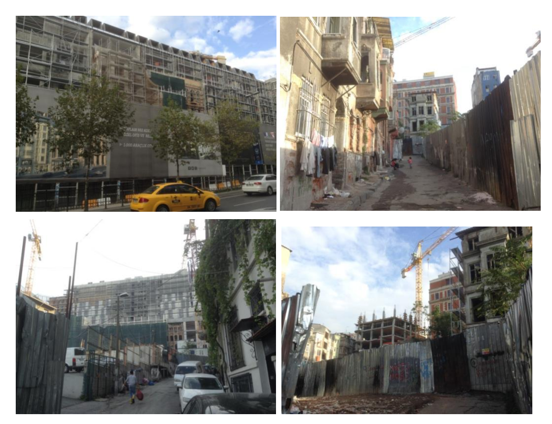
Figures 12, 13, 14, and 15: Photos from and around the Tarlabasi Renewal Project area, Author's personal archive, 2017.